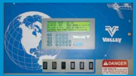
GPS Guidance panel

GPS Guidance eliminates the need for below-ground guidance options. With the custom Valley mapping tool you can easily program the field map to best match changes in farm practices or field boundaries. The diverse platform supports multiple brands of RTK receivers, such as John Deere® and Trimble®.